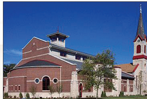
The Priests of the Sacred Heart minister at St. Martin of Tours parish in Franklin, WI.