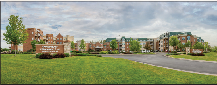
Sacred Heart at Monastery Lake in Hales Corners, WI, were the retired priests and brothers are cared for after retirement.

Dehonians, Priests of the Sacred Heart, SCJs — several names for a religious community of priests and brothers with a single mission: bringing the love of the Sacred Heart to those in the greatest of need.