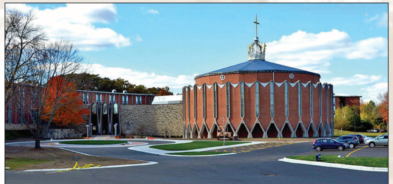
Sacred Heart Seminary and School of Theology in Hales Corners, WI