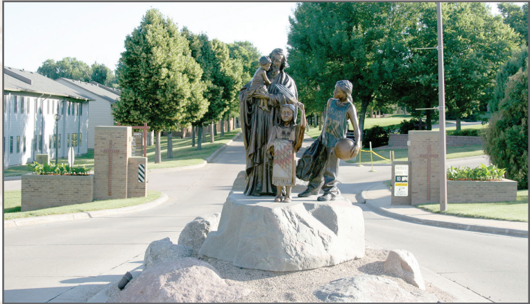
The entrance to St. Joseph's Indian School in Chamberlain, SD.